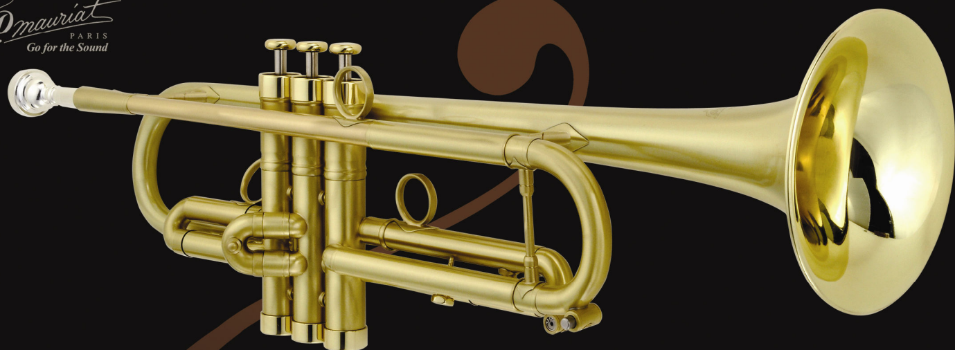
PMT - 700 M