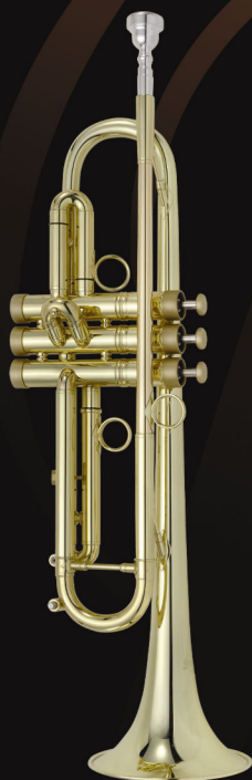
PMT - 700 L