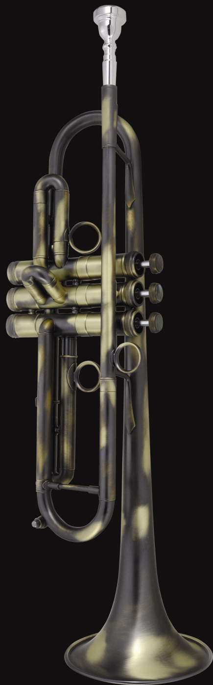
PMT - 655 DK