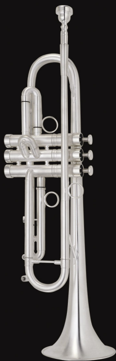
PMT - 700 MS

The 700 is the horn of choice for top professional jazz and commercial musicians. These styles demand a horn that responds to the player as well as it does to the audience. Therefore, the weight of the 700 is balanced in the midsection allowing the instrument to vibrate freely from start to finish. The effect is an enjoyable experience with a sound that is distinctively your own.