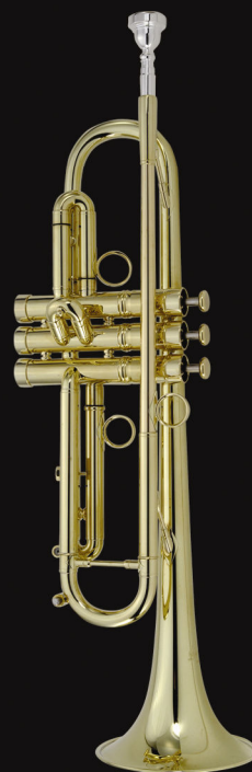
PMT - 700 UL