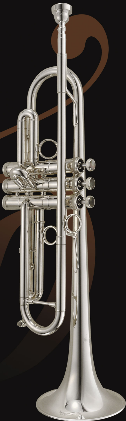
PMT - 655 S