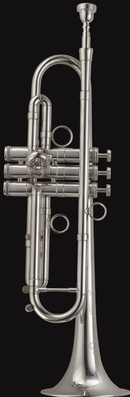
PMT - 600G S