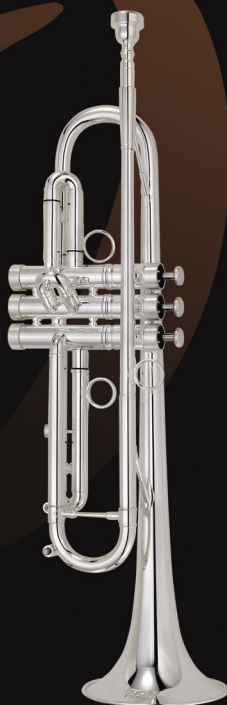
PMT - 700 S