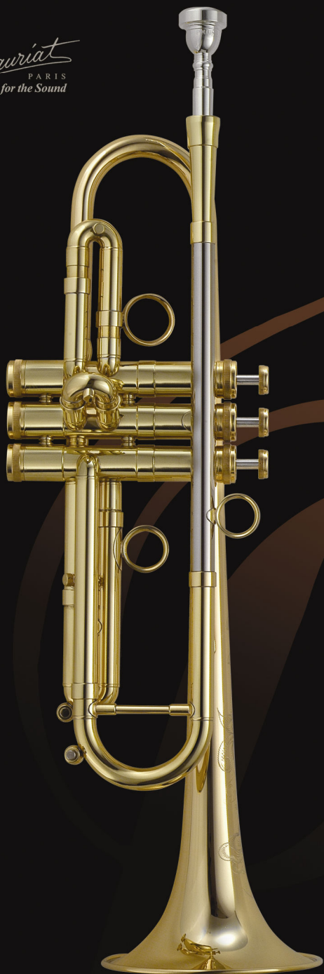
PMT - 600G L