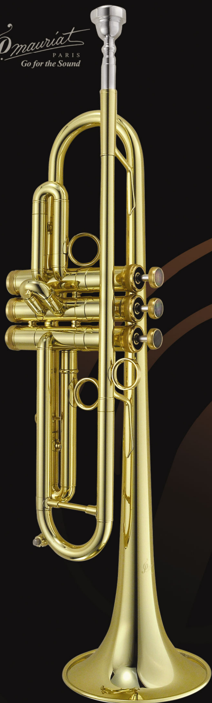
PMT - 655 L